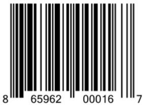
Timber Creek Southern Reserve Florida Whiskey (750ML)