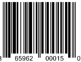
Timber Creek Florida Whiskey (750ML)