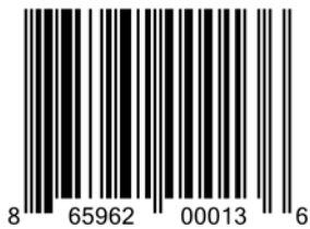
Timber Creek Florida Vodka (750ML)