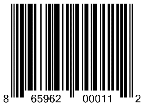
Timber Creek Barrel Aged Florida Rum (750ML)