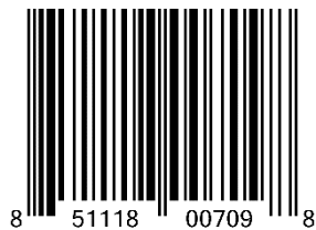
Timber Creek Florida Gin (750ML)