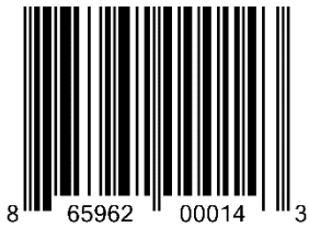
Timber Creek Florida Coffee Rum (750ML)